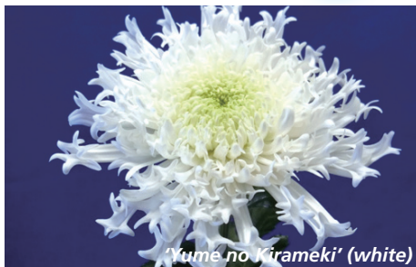
'Yume no Kirameki' (white)

Enjoy Aichi Prefecture's flowers, the best in Japan, which are produced with outstanding technology.